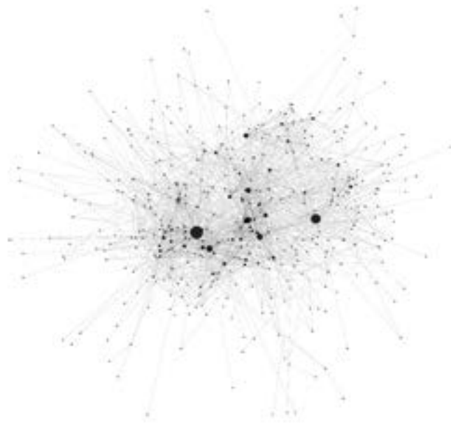
Figure 1: The 'Milky Way' of transnational university intermediaries

Nodes Intermediaries within the largest component (N = 451) Relations Bi-directional ties of intermediaries on the WWW (N = 1640) Node size Number of bi-directional ties (average degree = 7.27)