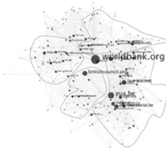
Figure 3: Four clusters in the transnational field of university governance

web addresses for different parts or programmes of the organisation, and those were in the project technically merged manually as one single umbrella website for the continued analysis. This particular organisation exhibits a large number of ties with other actors in the field, as indicated by the sheer size of the node in the illustration (see Figure 3). What is more important, however, is that the World Bank cannot easily be subsumed into one or the other cluster through a denser set of ties with a particular cluster. Neither can the World Bank be said to serve as the centre of the field with its still polycentric character. The special position of the organisation as an interlinking node across the clusters in the field is, however, stable as it has more or less equally strong ties with members of all the four identified clusters and it is thus positioned in a unique in-between role potentially bridging the clusters.